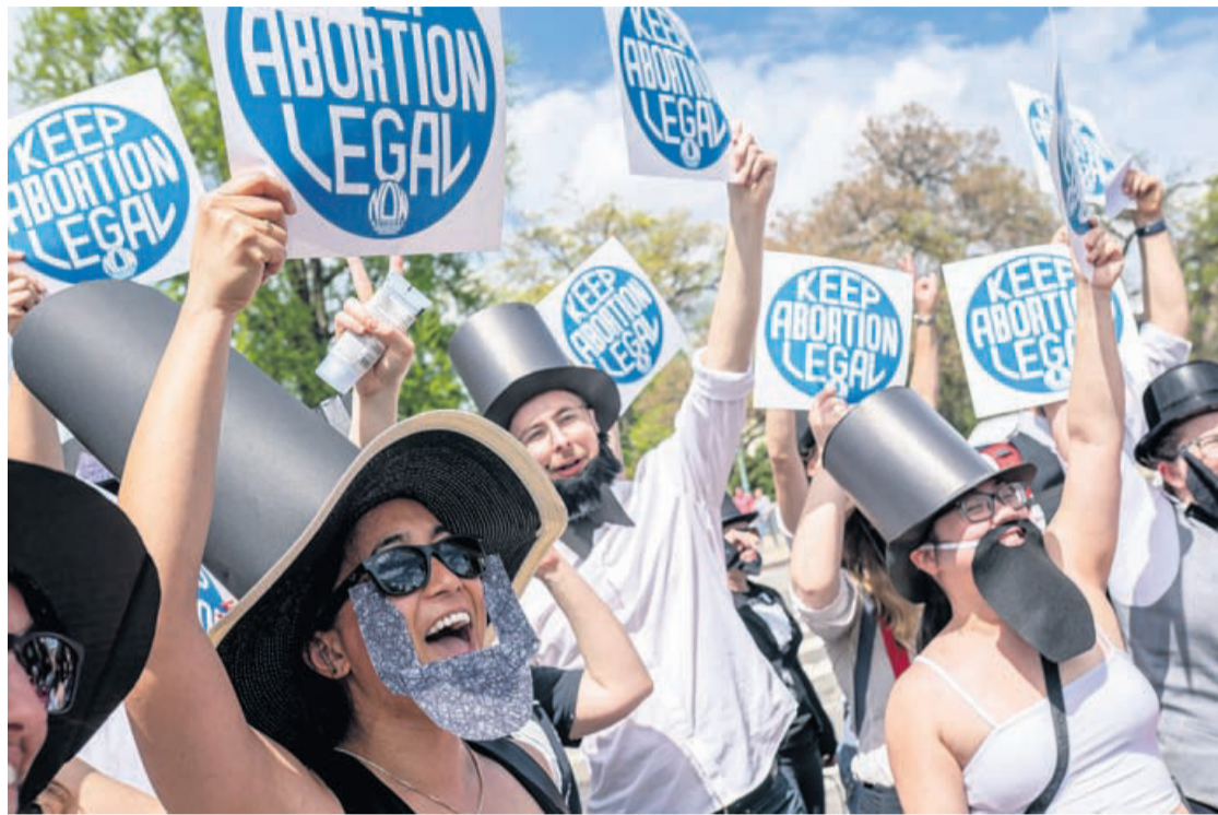
Protesters dressed as Abraham Lincoln chant during a Planned Parenthood rally in support of abortion access outside the U.S. Supreme Court, April 15, 2023, in Washington.

AAPI adults are more likely than Americans overall to identify as Democrats, which may partially explain why